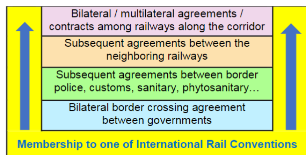
Fig. 2. Layers of legal interoperability

As customers are interested in door to door transport solutions, railways must develop adequate interfaces with road, water and air transport to become part of logistic chains. It should be a vital objective for the railways, knowing that the