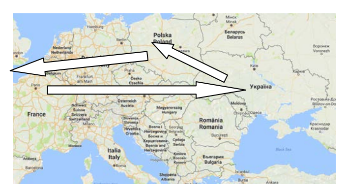
Fig. 2. The most attractive areas for tourists from Ukraine to Europe

For tourists from Ukraine can become the most attractive areas: Ukraine – Poland – Baltic countries – Ukraine, Ukraine – Poland – Central Europe – Ukraine (fig. 2).