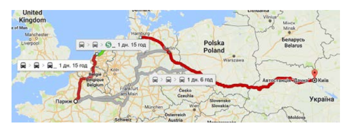
Fig. 4. The example of intermodal transport and logistics schemes for passenger transportation by railway transport within Ukraine-Europe direction

So, one of the most popular routes by railway transport within Ukraine-Europe direction is Kiev – Berlin – Hamburg – Paris (fig. 4) under questioning of 983 respondents that was conducted in 2016 year. On this route we can unite train and bus in intermodal transportation. The main idea was in using single travel document and implemented by a single company – Public joint-stock company «Ukrzaliznytsia». On fig. 4 red color was using for train direction and green color – for bus direction.