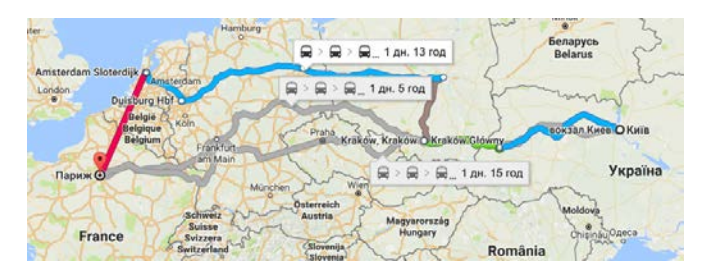
Fig. 5. The route of intermodal transport and logistics schemes for passenger transportation by railway transport within Ukraine-Europe direction

Also was analyzed route Kiev – Krakow – Amsterdam – Paris (fig. 5). There is combine also train and bus directions. On fig. 5 crimson and green colors was using for bus direction and blue and gray colors – for bus direction.