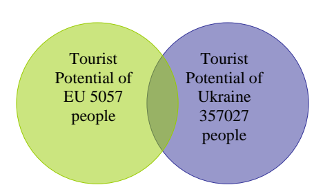
Fig. 1. Ukraine tourism potential model for calculating the prospective demand for intermodal passenger tourists by train

Recently the passenger turnover between Europe and Ukraine is increasing in leaps and bounds, and this fact is a stimulus for transport companies of Ukraine to create new logistic schemes for passenger and tourists transportation (fig. 1) [1].